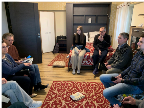
The workers for the Iași campaign worshipping together in a hotel room (Iași Spring 2023)