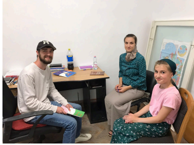
Studying with a couple of Pentecostals in Arad (Arad Summer 2023)