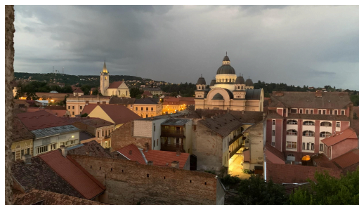
The view from my hotel în Târgu Mureș, where I spent 3 days to encourage members who worship from their home (Târgu Mureș Summer 2023)