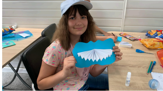
A Ukrainian Bible Class student posing with a craft she had made (Cluj Summer 2023)